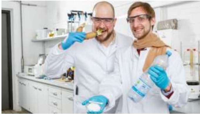
“Nylon from Chicory”