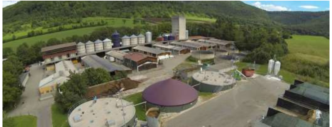
Research station “Unterer Lindenhof” location of Biorefinery Technikum