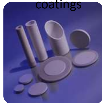
Alloys & ceramic materials