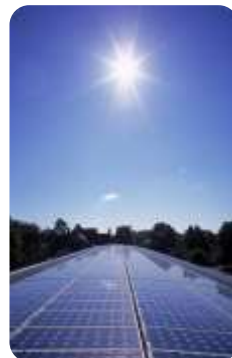
Solar cell materials