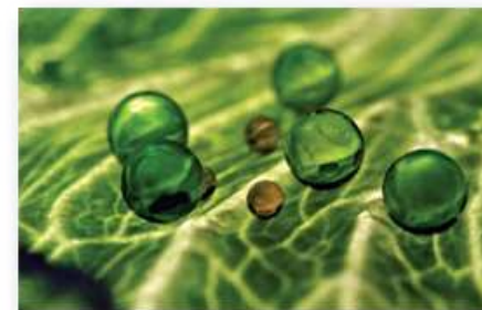
Micro – capsules