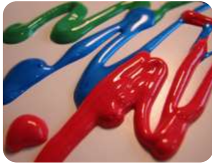
Inks, paints & coatings

E.g. Collaboration Applisurf : UGent, BBEPP,... & Industrial partners in field of 'Bio-surfactants'